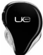
UE LEGACY LOGO