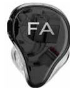
OWN INITIALS CHROME