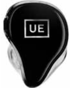
UE NEW LOGO