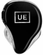
UE NEW LOGO