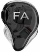
OWN INITIALS CHROME