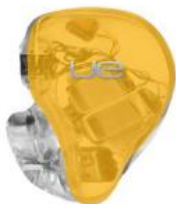
GOLDEN YELLOW TRANSLUCENT