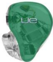
EMERALD GREEN TRANSLUCENT