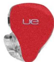
LUCKY RED SPARKLE