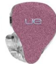
BUBBLE GUM PINK SPARKLE