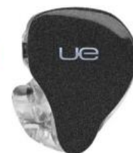
JET BLACK SPARKLE