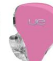
BUBBLE GUM PINK