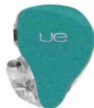
MARINE TEAL SPARKLE