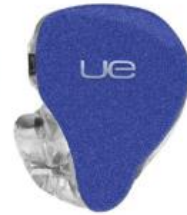
ROYAL BLUE SPARKLE