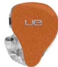
ORANGE RUST SPARKLE