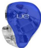
ROYAL BLUE TRANSLUCENT