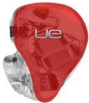
LUCKY RED TRANSLUCENT