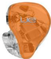
CITRUS ORANGE TRANSLUCENT