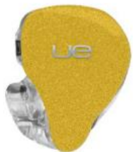
BRIGHT YELLOW SPARKLE