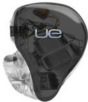
JET BLACK TRANSLUCENT