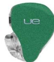
EMERALD GREEN SPARKLE