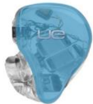
SKY BLUE TRANSLUCENT