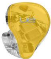
BRIGHT YELLOW TRANSLUCENT