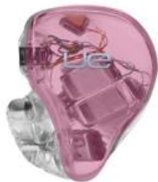
BUBBLE GUM PINK TRANSLUCENT