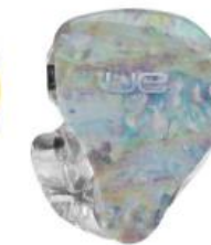
MOTHER OF PEARL