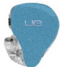
SKY BLUE SPARKLE