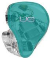
MARINE TEAL TRANSLUCENT