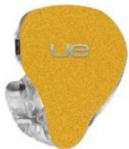
GOLDEN YELLOW SPARKLE